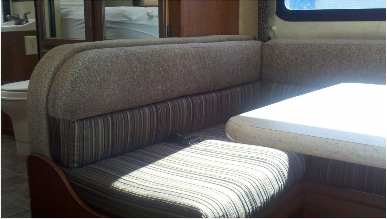
Picture #1 – Go to the “Front Facing” bench seat in the dinette area