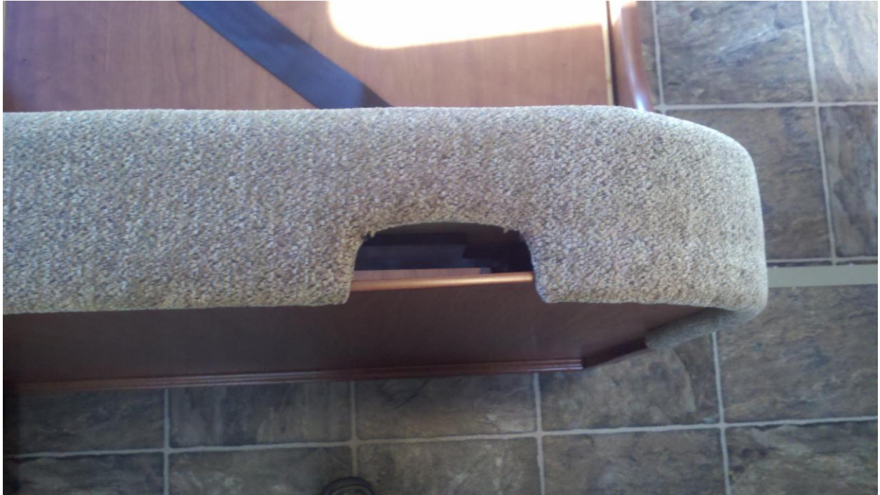
Picture #3 – Locate the hole in which the “Child Seat” Tether will go down into