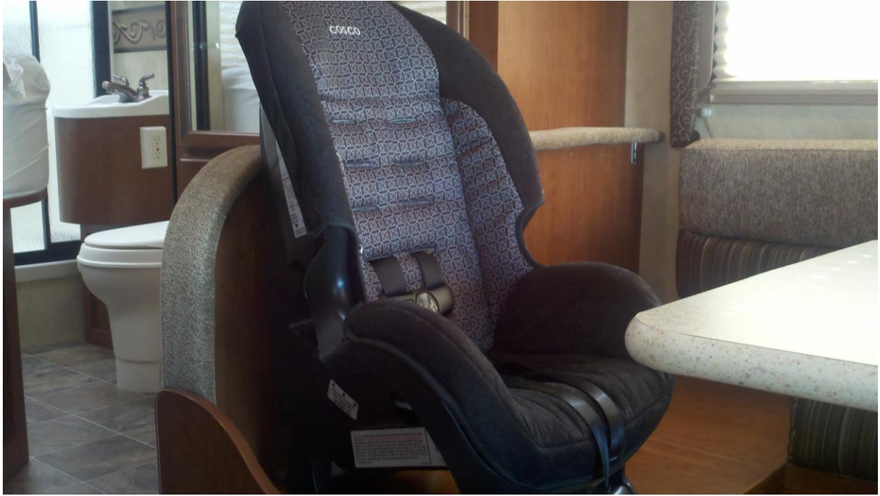
Picture #7 – Attach the regular seat belts through the holes across the bottom of the child seat

This completes the installation of the child seat.